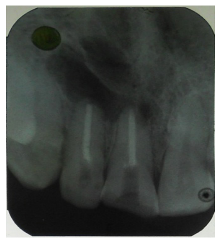
Figure 2: showing periapical radiolucency.

the upper front region of the jaw. Patients reported with a history of trauma 3 years ago (Figure 1). On examination, the tooth was tender to percussion and palpation. Radiographic examination revealed periapical radiolucency around root apex along with inadequate root canal therapy (Figure 2).