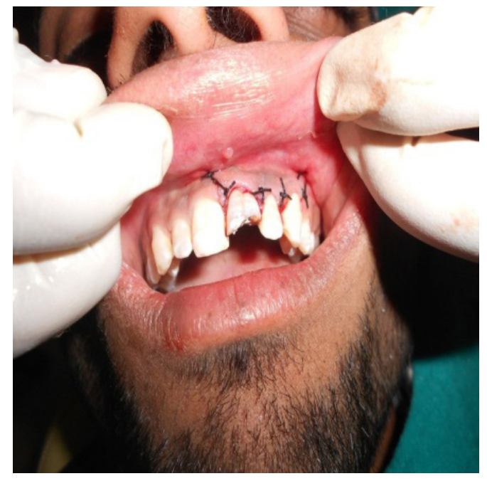
Figure 6: Flap repositioned and sutures placed.

Ostectomy helps in the removal of buccal cortical plate and exposes the pathological tissue. Straight fissure carbide bur was used