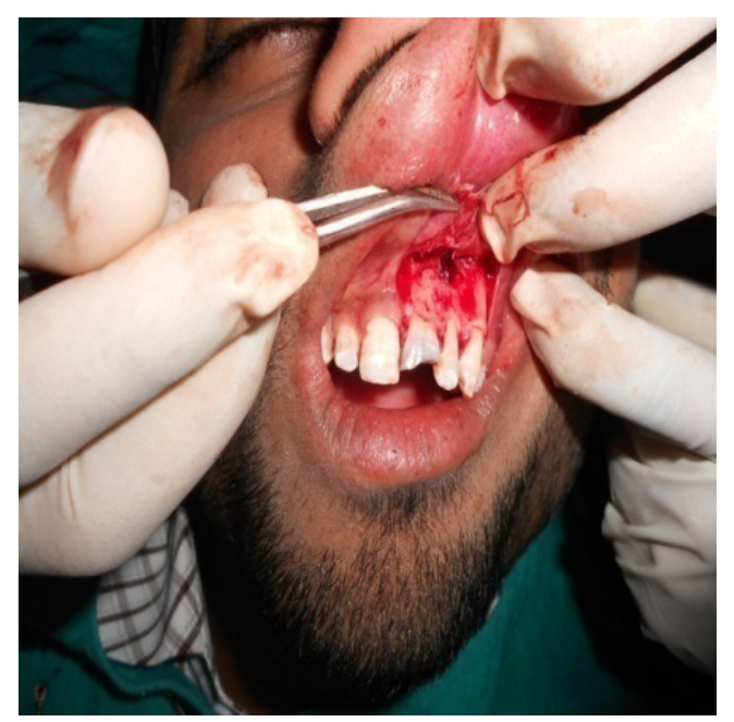
Figure 4: Flap raised and bony window created.

Continue the use of chlorhexidine mouth wash to reduce plaque accumulation along with antibiotics and analgesics. Cold