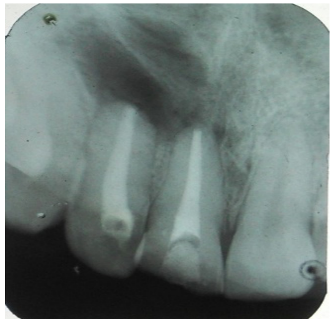
Figure 3: Showing retreatment done.

A total of 170 tapered fissure bur was used in high-speed handpiece (under constant irrigation), and a root resection was performed