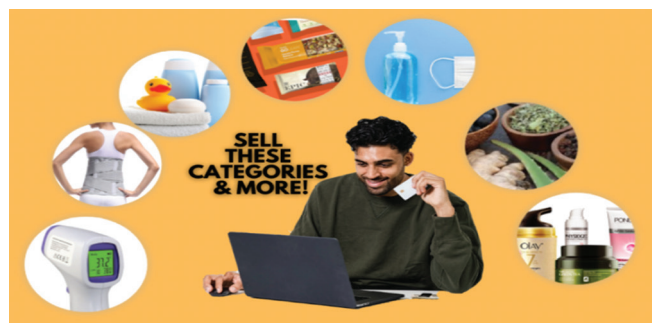
Retail E-Commerce Sales Growth, 2021