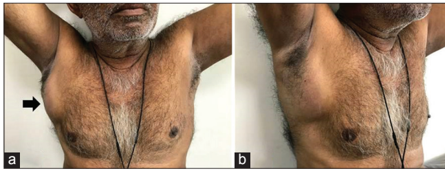
Figure 1: (a) Right-sided axillary swelling on clinical inspection. (b) Large, fixed, painless axillary mass