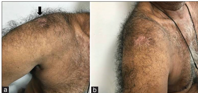
Figure 3: (a) Scar mark on the right arm with the underlying axillary mass. (b) Irregular scar on reevaluation

is higher in males, and usually, it presents in older age groups, mainly the fourth to fifth decade, like in our case. Different theories have been proposed to explain the absence of a primary lesion in these patients, including spontaneous regression of the primary tumor due to immune mechanisms, de novo origin of melanomas in tissues lacking melanocytes, and an unrecognized primary lesion. [8] Dasgupta et al. [9] have documented that ectopic benign nevus cells have been found in lymph nodes and other tissues which can give rise to MM. This finding has been supported by Shenoy et al. [10] who have reported melanoma arising from nevus cells in a lymph node. Few researchers have also documented that, in most cases where the primary tumor could be identified initially, the history was that of an previously excised pigmented lesion. Following it, one may see either a hypopigmented area or an irregular flat-pigmented scar at the site of excision. [1] In our case, the patient had a scar on his right arm after being operated for a blackish-brown-colored patch. We suspected it to be the primary lesion which now has presented as an axillary mass due to axillary lymph node metastasis; however, no confirmatory