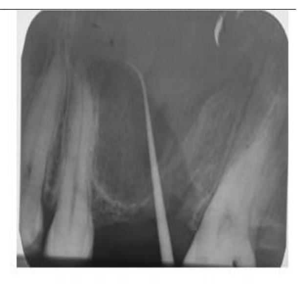
Fig 2: Dental radiography with gutta percha cone confirming the communication between the oral cavity and the left maxillary sinus