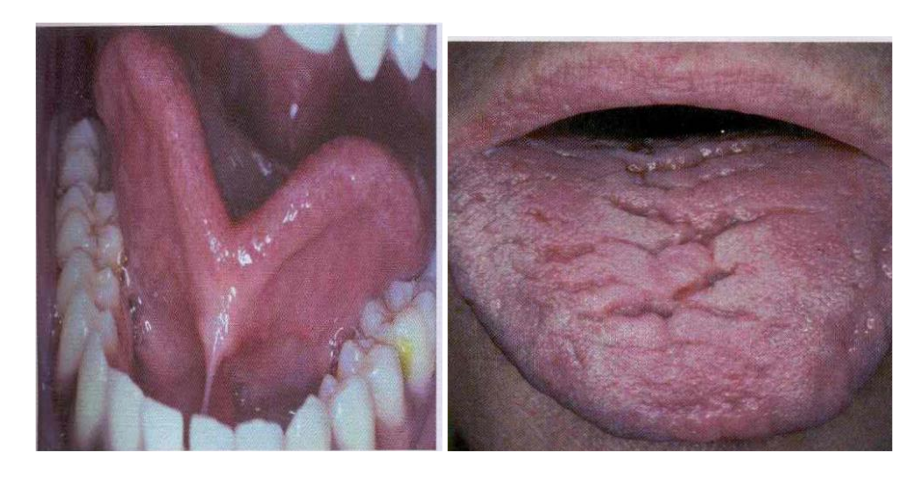
Fig 3: Ankyloglossia